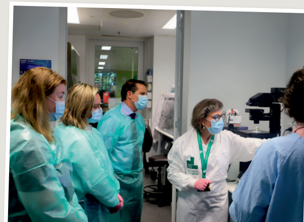
Visiting the Childrens Cancer Institute at UNSW