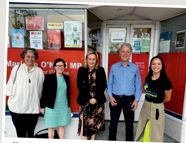
Meeting with Doctors for the Environment Australia