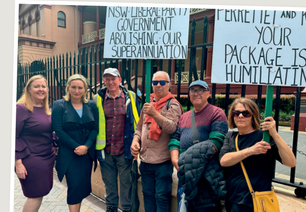
Supporting our Taxi Drivers