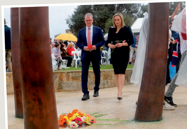
Remembering those we lost at Dolphin Point Bali Memorial