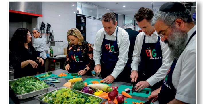
Visiting Our Big Kitchen which has been providing food to flood affected regions of NSW