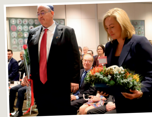
NAJEX Remembrance Day