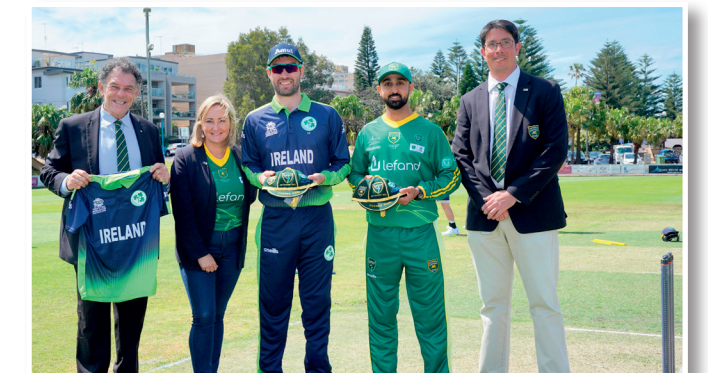
Randwick Petersham taking on Cricket Ireland at Coogee Oval